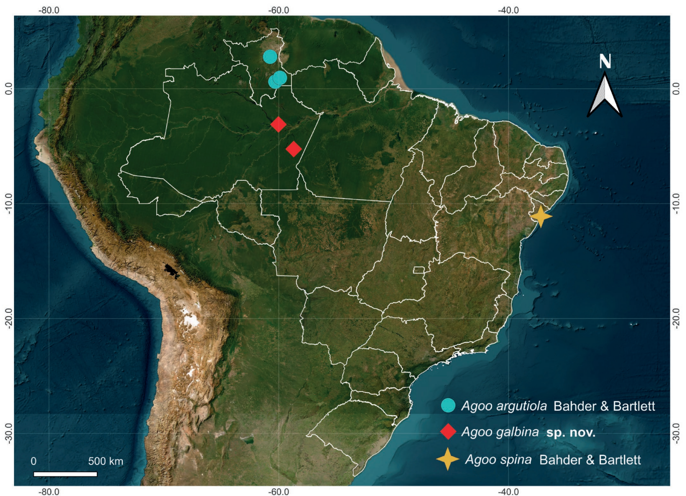
Figure 2. Geographical distribution of Agoo species of Brazil.

This study was financed by the National Council for Scientific and Technological Development (CNPq) (Project: Contribuição para o conhecimento da diversidade, taxonomia, sistemática e evolução de Empidoidea (Diptera, Brachycera), e outros grupos de Insecta, na Região Neotropical-312351-2021-6); the Amazonas State Research Support Foundation (FAPEAM) (Project: Guardado, mas desconhecido: um estudo sobre a fauna amazônica de Diptera (Insecta) armazenada em coleções científicas, com ênfase em famílias selecionadas-01.02.016301.01098/2023-50); Amazonas State Research Support Foundation (FAPEAM)-POSGRAD.