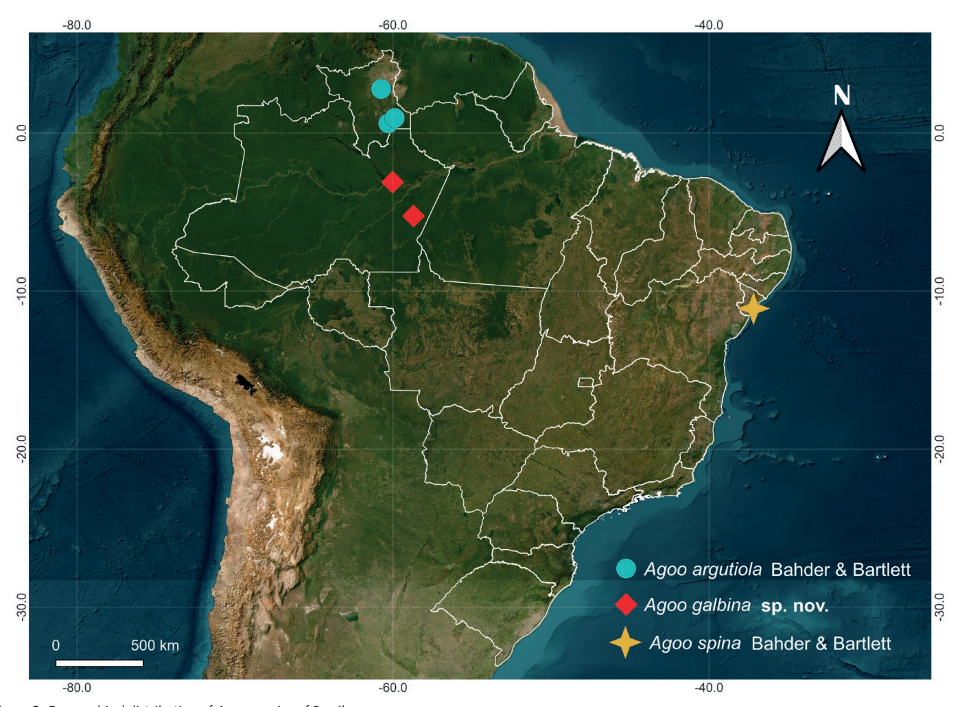
Figure 2. Geographical distribution of Agoo species of Brazil.

This study was financed by the National Council for Scientific and Technological Development (CNPq) (Project: Contribuição para o conhecimento da diversidade, taxonomia, sistemática e evolução de Empidoidea (Diptera, Brachycera), e outros grupos de Insecta, na Região Neotropical-312351-2021-6); the Amazonas State Research Support Foundation (FAPEAM) (Project: Guardado, mas desconhecido: um estudo sobre a fauna amazônica de Diptera (Insecta) armazenada em coleções científicas, com ênfase em famílias selecionadas-01.02.016301.01098/2023-50); Amazonas State Research Support Foundation (FAPEAM)-POSGRAD.