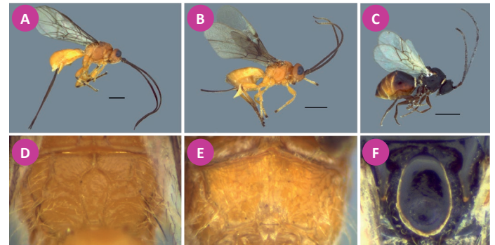
Figure 2. Parasitoids emerged from fruit flies. (A-D) Doryctobracon areolatus , lateral view (A) and propodeum (D). (B-E) Opius bellus , lateral view (B) and propodeum (E). (C-F) Aganaspis pelleranoi , lateral view (C) and scutellum (F).

as fruit crops, our results increase the documented host range of fruit flies in an area where other Myrtaceae are relevant in local fruticulture. The parasitoids that emerged are frequently associated with these fruit fly species. D. areolatus and O. bellus , are both very well distributed in Brazil, with the former being recorded for all states, and the latter with only Mato Grosso, Paraíba, Pernambuco and Sergipe missing records. Aganaspis pelleranoi however, although already registered for all five regions of Brazil, is here recorded for the first time for the state for Rio Grande do Norte.