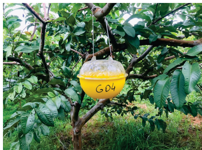
Figure 3. Ball trap hanging from a guava tree.