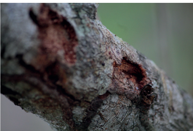
Figure 3. Fissure about 1-3 mm width with the plant exudate.

Two males of R. thoracicus thoracicus were observed feeding on the exudate (Fig. 4A) from the fissures (about 1-3 mm long) of the trunk of Schinus sp. (Fig. 3). One of the individuals feed in more than one fissure, while the other stayed feeding on the same fissure for all the period of observation (approximately 10 minutes). Next to these two cerambycids, the butterfly F. glycerium cratais was perching near to the trunk fissures with its wings in a resting position (Fig. 4B). While one of the beetles moved to another area of the tree, probably in search of other fissures to keep feeding, the butterfly began to feed on the exudate in one of the fissures near to one of the cerambycids (Fig. 4C). Later, one of the beetles moving along the trunk dispel the butterfly with the movement of its long antennae, causing it to fly to another location.