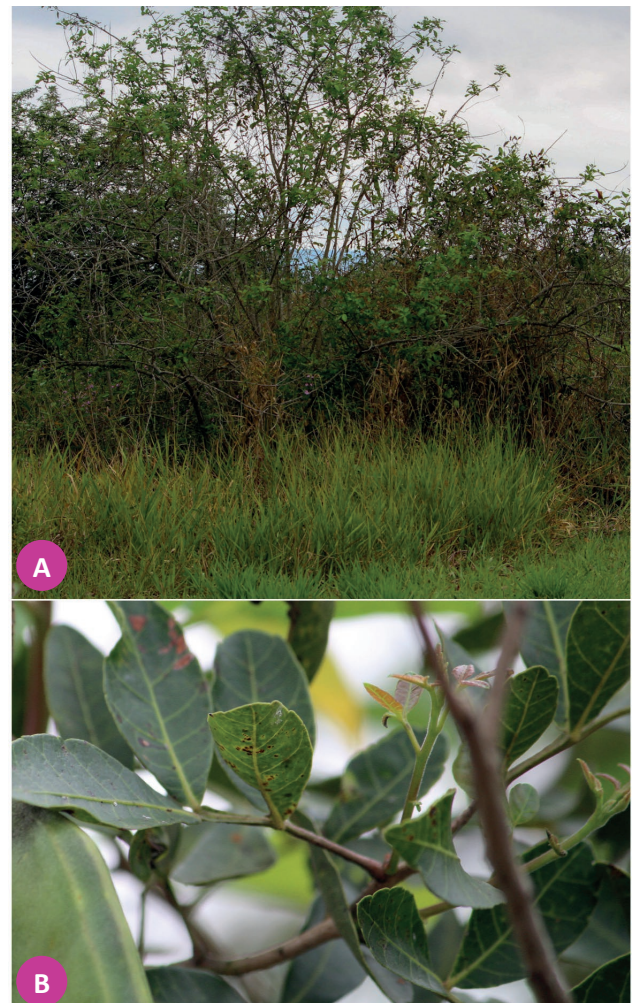
Figure 1. A, B - Schinus sp. tree.

The identification of the species R. thoracicus thoracicus and F. glycerium cratais was carried out at the Laboratório de Sistemática de Insetos (LASIS) by comparing specimens deposited at the Prof. Johann Becker Entomological Collection from the Museu de Zoologia (MZFS) at UEFS. Photographs of the individuals in situ were taken using a Canon T6 digital camera (55-250 mm). Geographical coordinates were obtained from Google Maps ( www.google.com.br/maps ). The map was elaborated with Simplemapp (Shorthouse 2010).