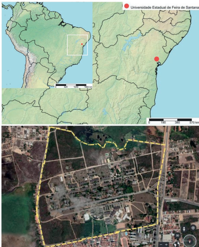
Figure 2. Map showing the area of the Universidade Estadual de Feira de Santana, Feira de Santana, Bahia, Brazil, highlighted in yellow dashed line.

Two males of R. thoracicus thoracicus were observed feeding on the exudate (Fig. 4A) from the fissures (about 1-3 mm long) of the trunk of Schinus sp. (Fig. 3). One of the individuals feed in more than one fissure, while the other stayed feeding on the same fissure for all the period of observation (approximately 10 minutes). Next to these two cerambycids, the butterfly F. glycerium cratais was perching near to the trunk fissures with its wings in a resting position (Fig. 4B). While one of the beetles moved to another area of the tree, probably in search of other fissures to keep feeding, the butterfly began to feed on the exudate in one of the fissures near to one of the cerambycids (Fig. 4C). Later, one of the beetles moving along the trunk dispel the butterfly with the movement of its long antennae, causing it to fly to another location.