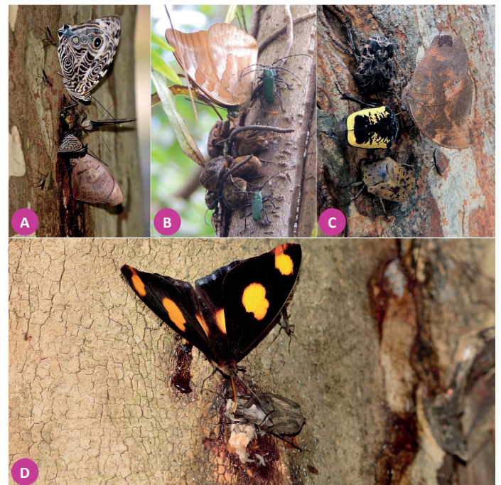
Figure 5. Species of butterflies and beetles feeding on plant exudate. A - Eunica sp., Diaethria candrena (Nymphalidae) and Smyrna blomfieldia blomfieldia (Nymphalidae) and Neocorvicoana reticulata (Kirby, 1818) (Cetoniidae); B - Archeoprepona demophon thalpius (Nymphalidae) and Aglaoschema sp. (Cerambycidae), Hoplopyga sp., Gymnetis sp. and Inca sp. (Cetoniidae); C - Memphis moruus stheno (Nymphalidae) and Gymnetis spp. (Cetoniidae); D - Catonephele numilia (Nymphalidae) and Hoplopyga sp. (Cetoniidae).

We also found other records of similar interactions on the Facebook page “Borboletas e Mariposas Neotropicais”, a group aimed at lepidopteran specialists and non-academics to share photos and information about the species. Groups like this are a valuable