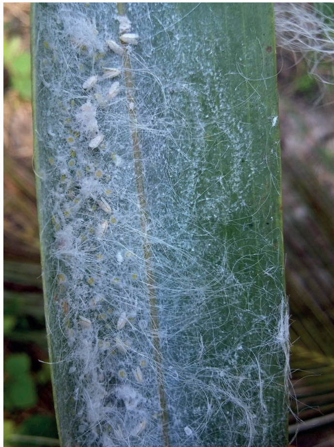
Figure 1. Aleurodicus pseudugesii Martin, 2008 (Hemiptera: Aleyrodidae) on coconut leaf.

plants. Given the economic importance of the host and its impact on coconut production, the parasitoid could be considered an alternative for controlling this species.