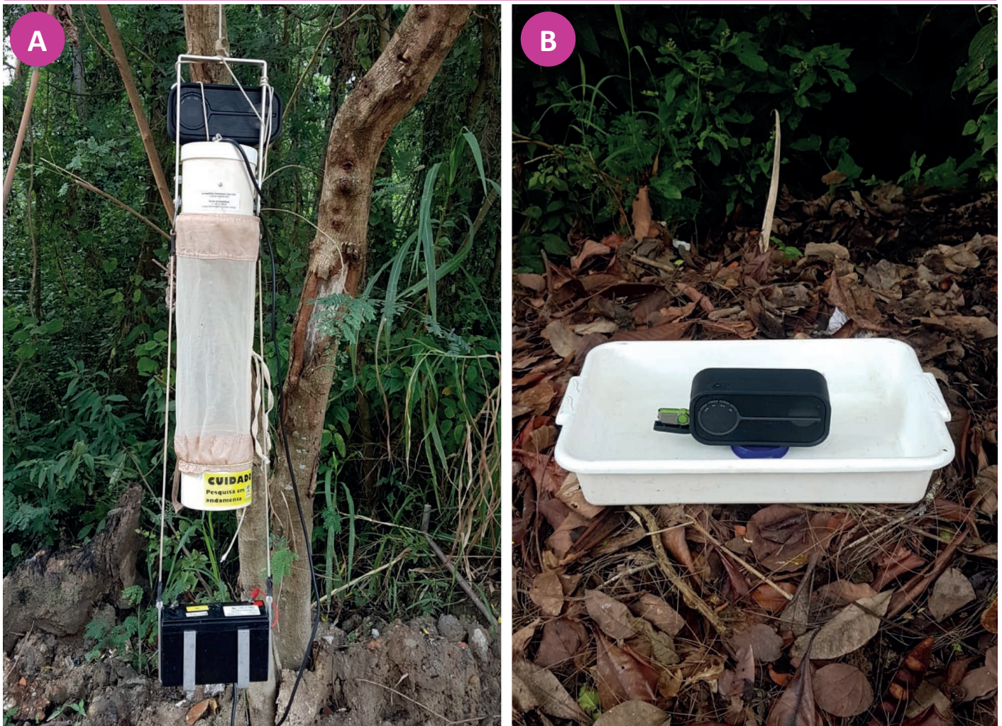
Figure 1. A illustrative photo of the traps used in the experiments. (A) CDC modified trap; (B) PTM trap.

cuvieri Fitzinger, 1826 and Physalaemus nanus (Boulenger, 1888), two frog species found at the study area. The mixed looping records were generated with the software Audacity® and the frog calls used are available at Haddad et al. (2005). We measured the sound pressure levels (dB) broadcasted by the speakers at 0.5m distance using the software Sound Meter - Abc apps®, resulting in P. cuvieri calls at 34-40 dB and P. nanus calls at 18-30 dB. We assess the normality of the data visually and proceed using a Wilcoxon signed-rank test.