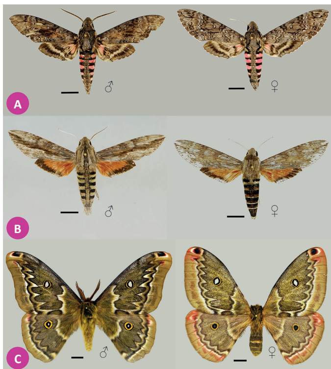
Figure 2. Sphingidae and Saturniidae recorded in the two forests of Polylepis sericea in Huascarán National Park. A. Agrius cingulata ; B. Erinnyis ello ello ; C. Copaxa medea . Scale = 1 cm.

(*) New records for Ancash. (**) New record for Peru.