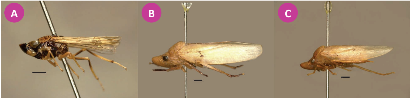
Figure 3. A-C. Lateral habitus of Proconiini. A. Acrogonia albertoi (male); B. Diastostemma cavichioli (male); C. Diastostemma dubium (male). Scale bar = 1 mm.

Note: The material used in the article was preserved in alcohol, which led to discoloration of the specimens and even a decrease in the number of brochosomes.