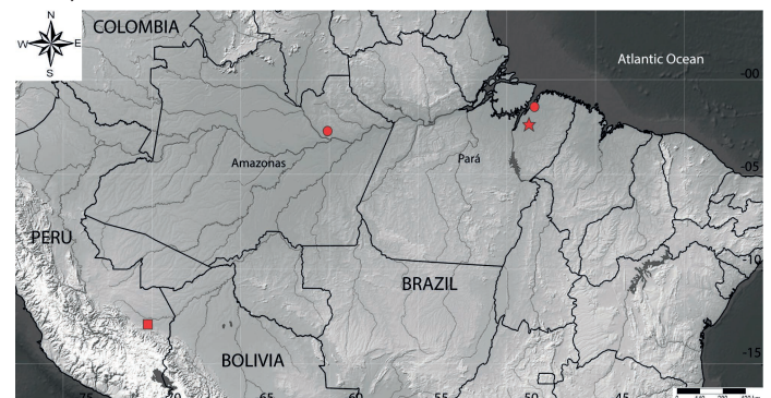
Figure 1. Records map of Yosiella mira Hüther, 1967 in South America, star represents the type locality and red circles represents additional record in original description, both in Pará state (Hüther 1967); red circles in Amazonas state indicate record previous (Oliveira & Deharveng 1995), and square represent new record in Inambari, Peru.

extractors (Berlese-Tullgren funnel), therefore they live under the litter until the first upper layers of the soil. This habit added to its small size (up to 0.8 mm) with worm-shaped elongated body, short appendages (antennae and legs), and devoid of furcula (Fig. 2), indicates that this species can be considered euedaphic (Eisenbeis & Whichard 1987). From this record, we believe that Y. mira could potentially be widely distributed in the Amazon biome. However, the euedaphic habit of Y. mira is a factor that most likely limit its dispersion, therefore populations from different localities (Fig. 1) need to be investigated molecularly to know if they actually consist of a single species. Regardless, Y. mira can be identified by fourth antennal segment with 9-10 sensillae including a subapical club-shaped microsensilla; eyes absent (Figs. 2A-B); postantennal organ narrow and with smooth margins, median region slightly contracted towards the interior; prelabral chaetotaxy with 2 chaetae; second thoracic segment to the fifth abdominal segment respectively with 1,1|1,1,1,1,3,1 sensillae; fifth and sixth abdominal segment with a pair of spines on each (Fig. 2C); and colophore with 4 lateral and 3 posterior chaetae. Chaetotaxy pattern of the antennae, head, thorax, abdomen and legs, as per the original description (Hüther 1967).